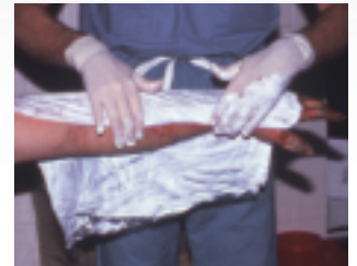
Wrap around burn site.