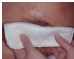
Cover with secondary dressing.