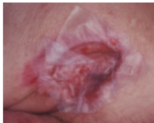
Line cavity. Extend Dermanet beyond wound edge.