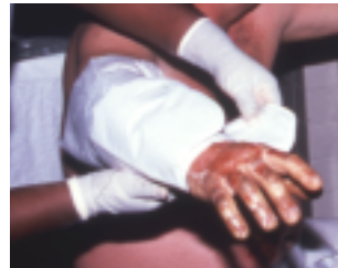
Apply chosen dressing.