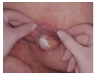
To remove, lift edges of Dermanet.