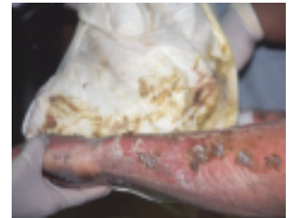
Removes easily without sticking.